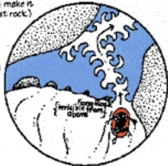
Fang (low Levels)