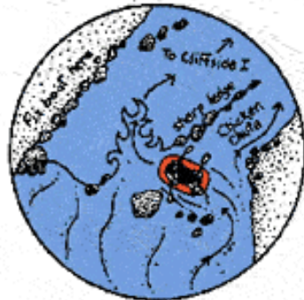
The Ledge (low levels)

A map should never be used as a substitute for scouting. If unfamiliar with the Gorge, scout all major drops or go with a raft company.